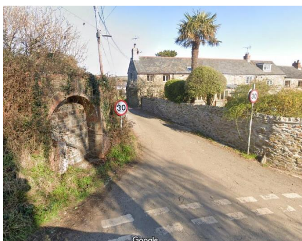
Gibb – NB Gibb Cottages are outside the speed limit

There is no speed limit sign coming down Brent Hill. In Ford and Luson the speed limit is the national 60 mph.